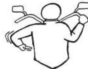
Time for a pit stop