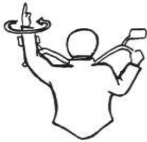
Start your engines