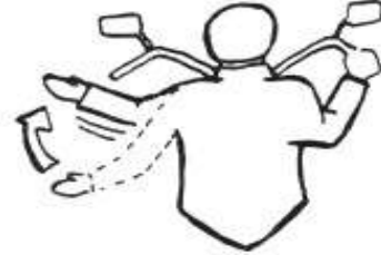
Go ahead and pass me