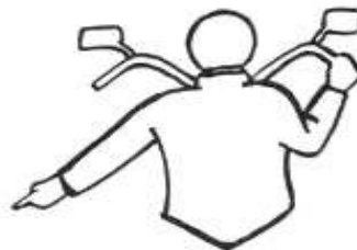
Hazards on the road