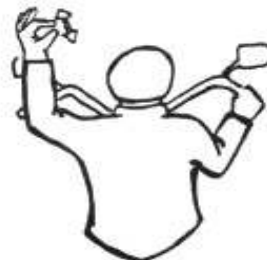
Turn off your turn signals