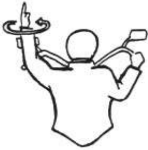
Start your engines