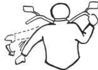
Don't pass me