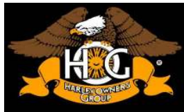
Stan Austin Safety Stan