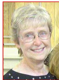
And His Lovely Co-Star