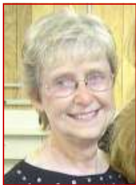
And His Lovely Co-Star