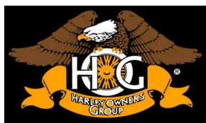
Tracy Akeret Ramblings from Silk