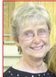
And His Lovely Co-Star