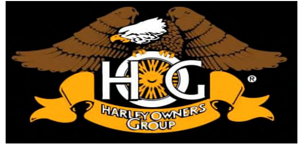
Road Capt. Coord. Rex Walraven