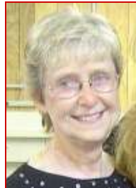
And His Lovely Co-Star