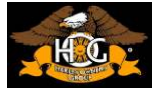
Rex Walraven Semper Fi Oo-Rah