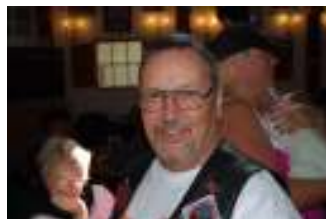
Slow poke Furnish