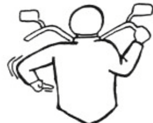
Time for a pit stop