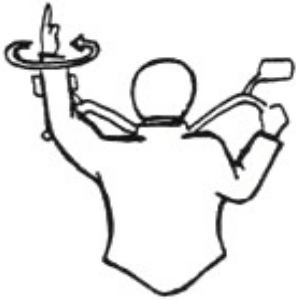
Start your engines