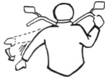
Don't pass me