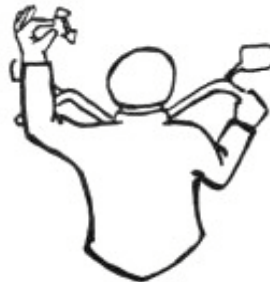
Turn off your turn signals