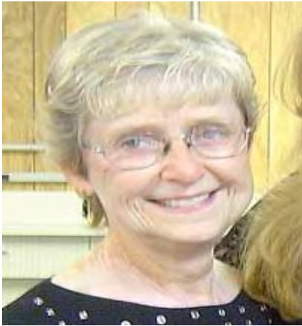
And His Lovely Co-Star