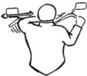
Stop your engines