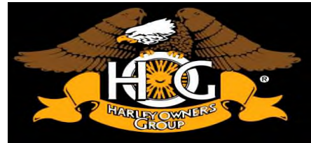
Road Capt. Coord. Rex Walraven