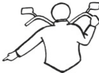
Hazards on the road