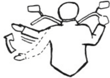
Go ahead and pass me