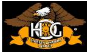
Rex Walraven Semper Fi Oo-Rah

The summer riding season has been hot around here, but then I have not been here for most of it due to work travel. I hope everyone has some good rides in this summer and look forward to many more in the fall. We have been working on getting our Road Captains more up to speed in how we are organized as a group in riding events.