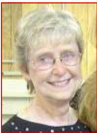
And His Lovely Co-Star