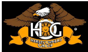
Bland Burchett Spokes Road Captain Coord.