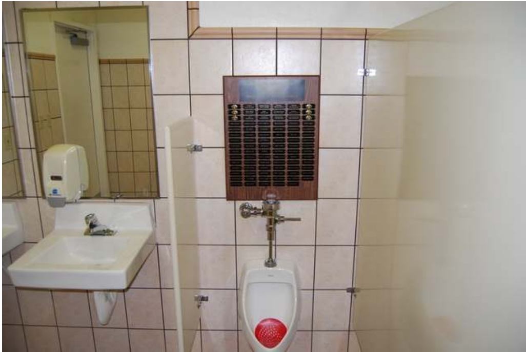
RAG Member Board Pics