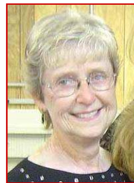
And His Lovely Co-Star