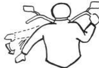
Don't pass me