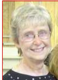
And His Lovely Co-Star