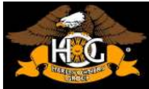
Tracy Akeret Ramblings from Silk