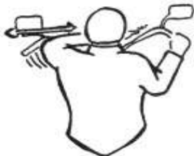
Stop your engines