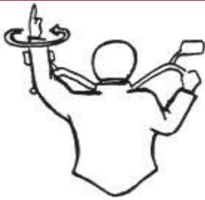
Start your engines