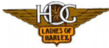
Ladies of Harley Billee Burchett