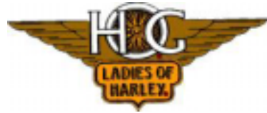
Ladies of Harley Billee Burchett